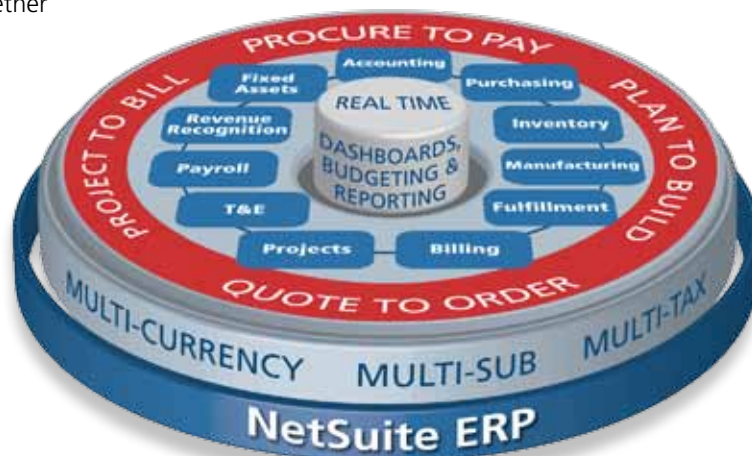
Powerful, Comprehensive Cloud ERP