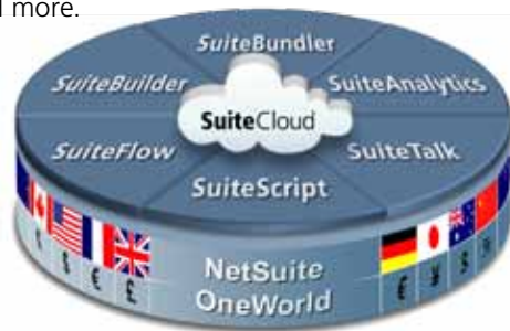
NetSuite Enables Complete Global Customization

With SuiteCloud, NetSuite allows each subsidiary to meet specific geographic, organizational and industry needs—such